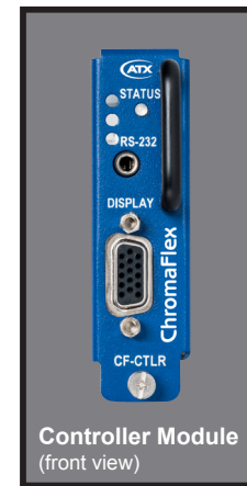
Controller Module (front view)