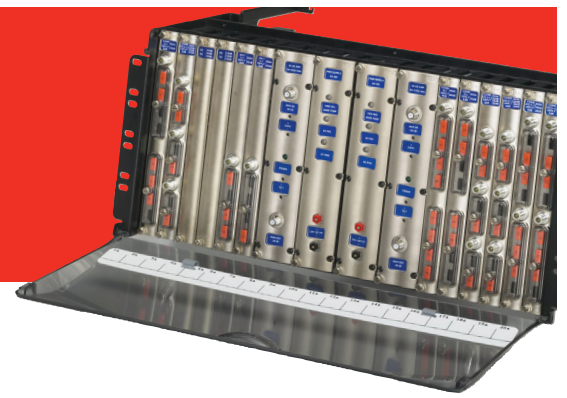
5RU Chassis (front view)