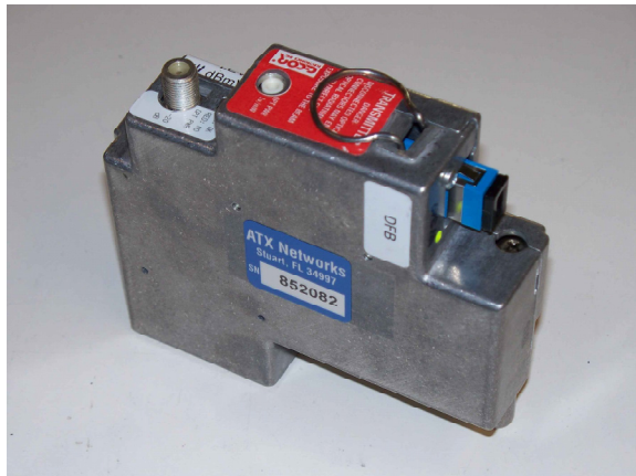
Figure #1 HEFN****C Upgraded Return Path Transmitter

Figure #1 illustrates the HEFN****C Upgraded DFB-based Return Path Transmitters.