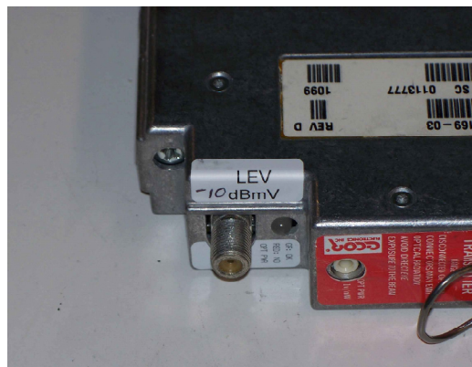
Figure #3 Laser Drive Level Label