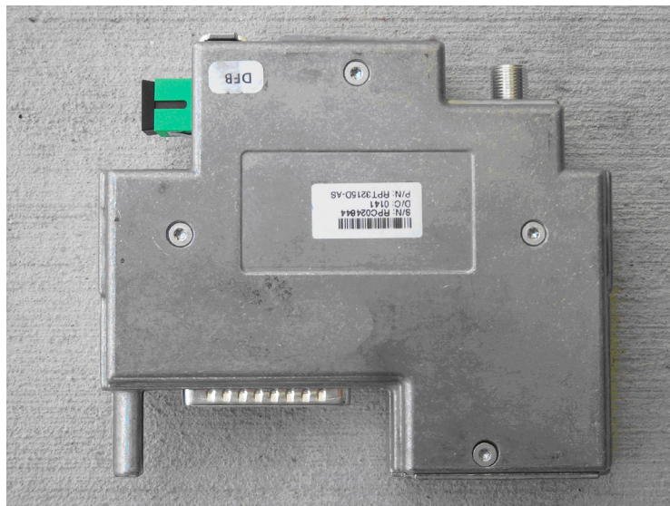
Figure #1 HEFN**** Return Path Transmitter

Figure #1 illustrates the HEFN**** DFB-based Return Path Transmitters.