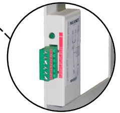
MN5BAR Remote Powered Active Chassis (rear close-up view)