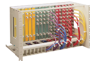
MN5R Rear Mount Chassis pictured with but not including MN1RK, 1RU Cable Management Tray (front view)