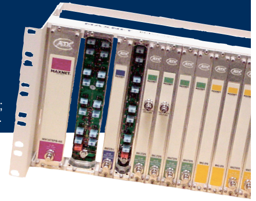
5RU Standard RF Chassis (front view)

Patented U.S.# 6,842,348; Cdn.# 2,404,844