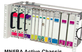
MN5BA Active Chassis (front view)